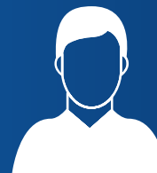
This could be you! ILAC HIGHER ED Future Entrepreneur

Apply today and you could be well on your way joining us at Georgian at ILAC and to making your dreams come true!